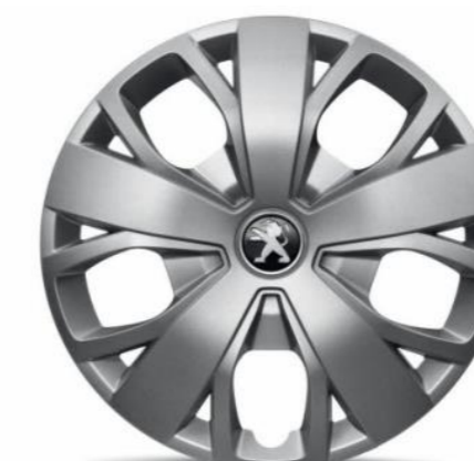
435 Panel Vans