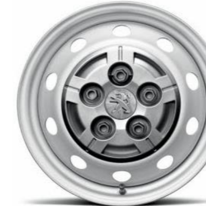
435 Panel Vans