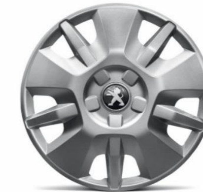
335 Panel Vans