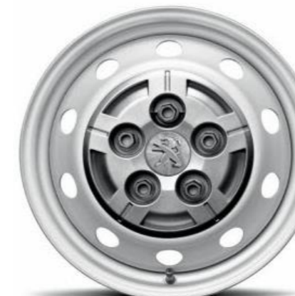
440 Panel & Window Vans