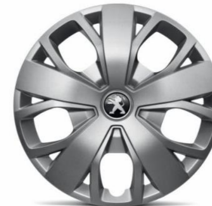
440 Panel & Window Vans