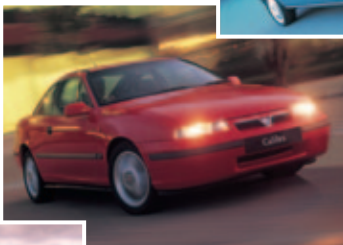
1990 – The Calibra was the world's most aerodynamic production car.