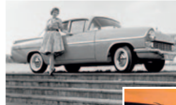
1957 – The PA Cresta introduced Americana styling to the UK.