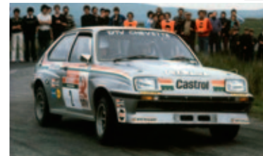
1971 – The formation of Dealer Team Vauxhall (DTV). The track car was the precursor to our enormous success in touring car racing.