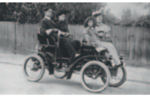
1903 – Forward thinking has been in our nature from the very start. The 6HP, our first ever car, had two forward gears. And no reverse.