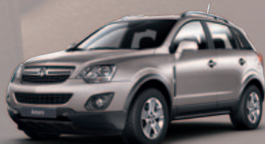
Sandy Beach Brown – Metallic*