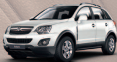
Summit White – Brilliant

Show your true colours. Antara is available in a carefully selected range of paint and interior finishes.