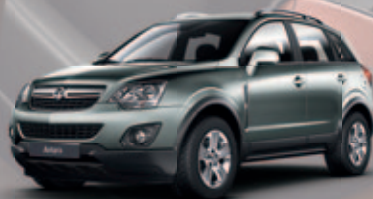
Placid Grey – Metallic*