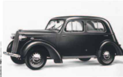
1937 – The Vauxhall 'H'-type, the first British car to have integral construction.