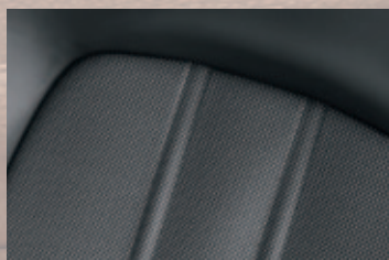
Charcoal Wicker cloth/Morrocana

• = This colour and trim combination is available. - = Not available. * = Optional at extra cost. ** = No-cost option in lieu of Charcoal leather.