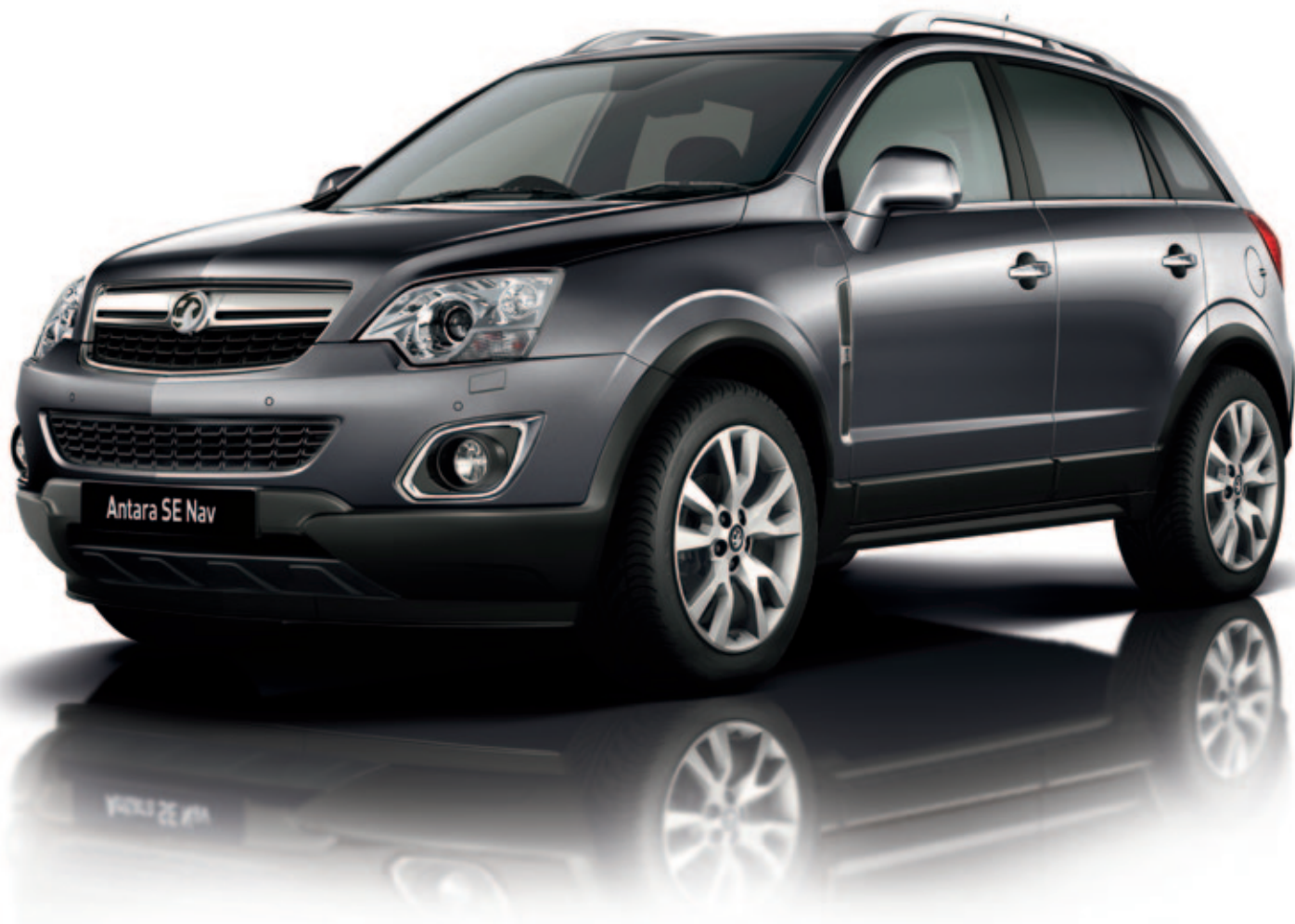
Model illustrated features two-coat metallic paint, optional at extra cost.