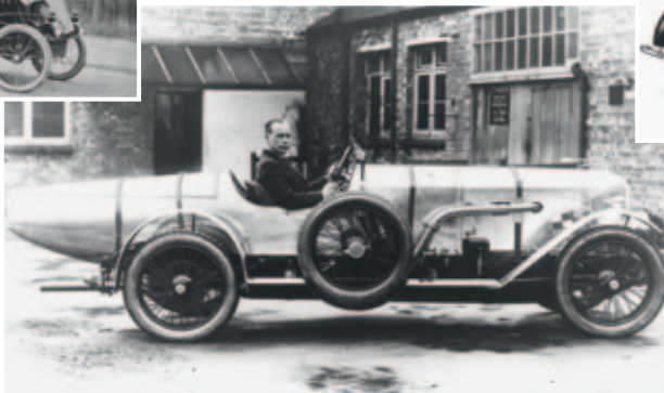
1922 – The Silver Arrow OE 30-98 was capable of speeds of over 100mph, this model was built for shipping magnate Sir Leonard Ropner to race at Brooklands.