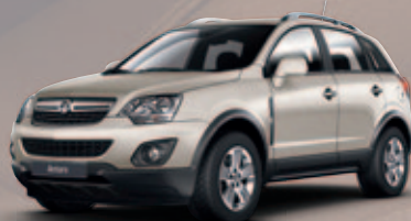
Daydream Beige – Metallic*