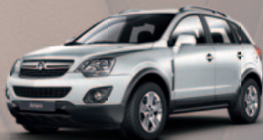
Sovereign Silver – Metallic*