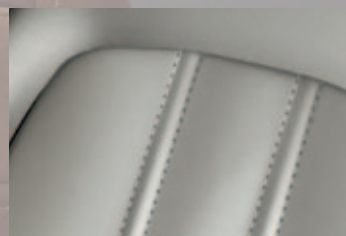
Light Titanium leather