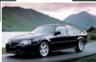
1989 – The Lotus Carlton was the world's fastest production four-door saloon.