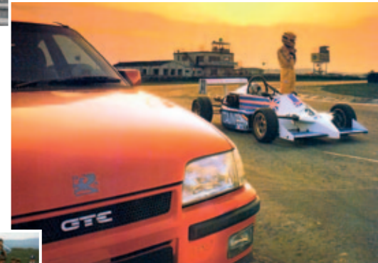
1984 – The MkII Astra introduced class-leading aerodynamic styling that still looks good today. The Formula Vauxhall Lotus ran a modified version of the Astra GTE's 2.0i 16v engine.