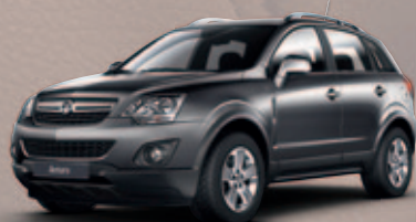
Smoke Grey – Metallic*