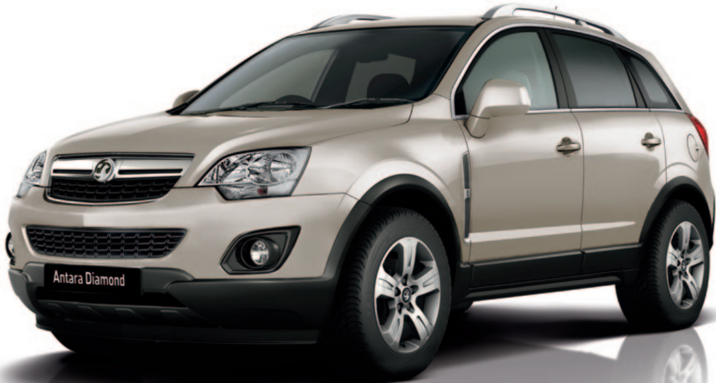
Model illustrated features two-coat metallic paint, optional at extra cost.