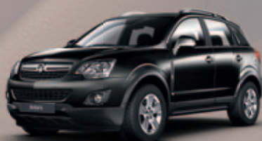
Carbon Black – Metallic*