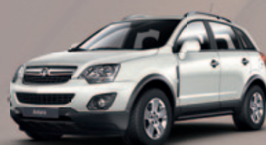
Snowflake White – Premium*