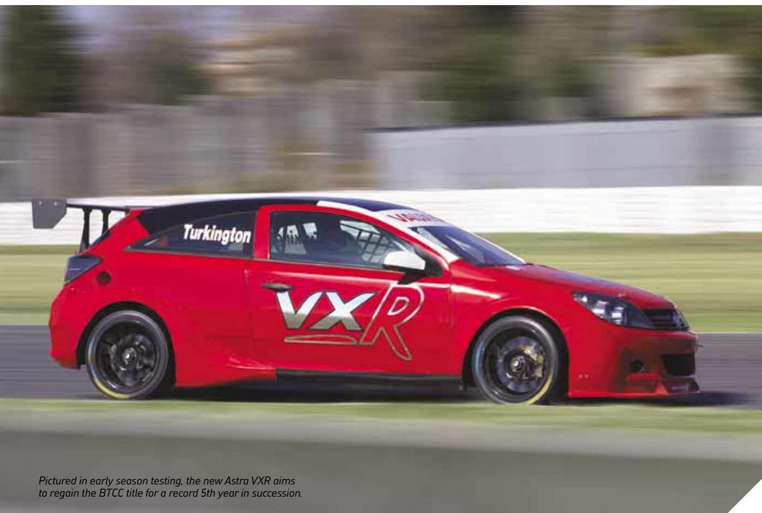
Pictured in early season testing, the new Astra VXR aims to regain the BTCC title for a record 5th year in succession.